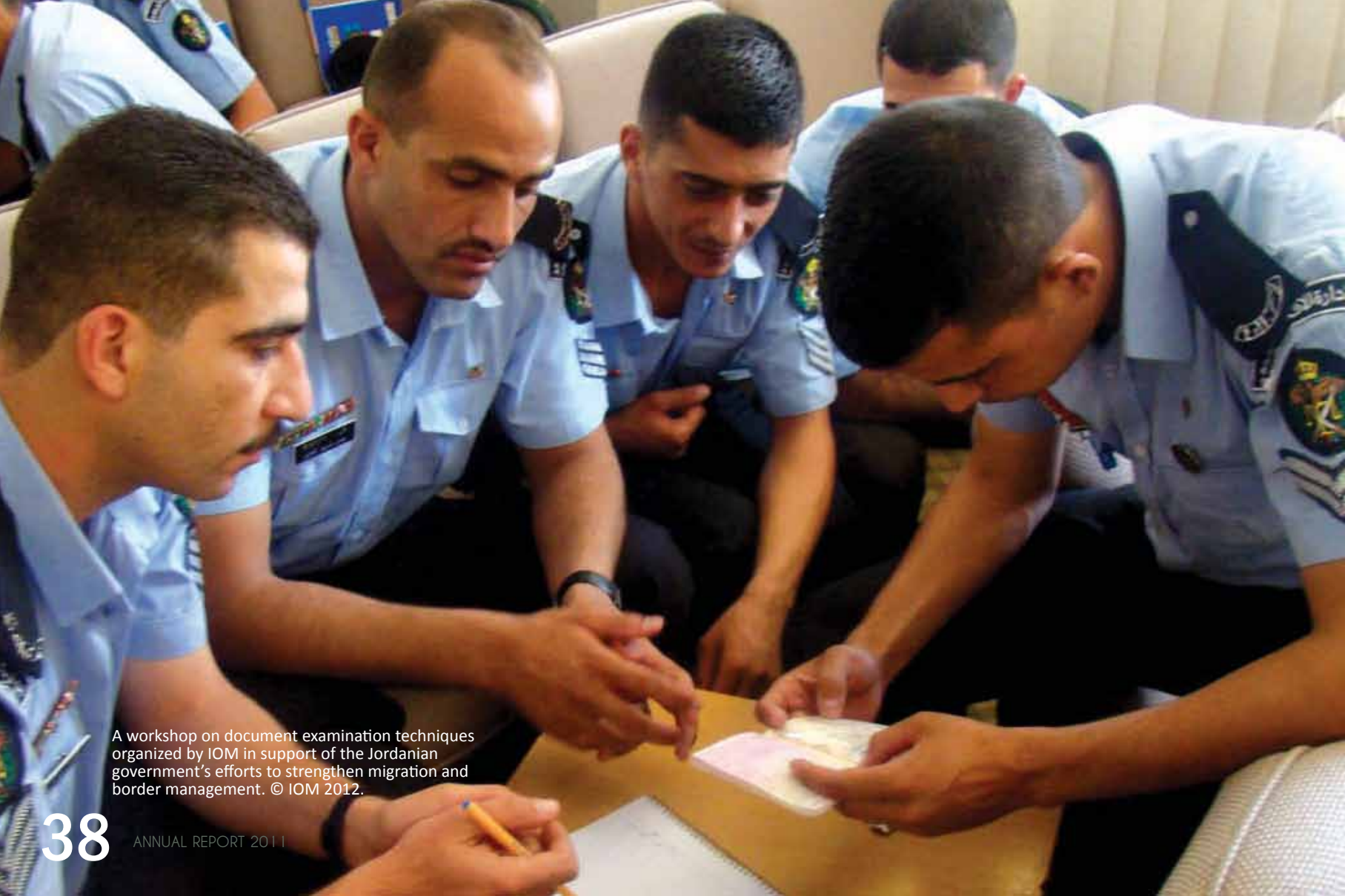
A workshop on document examination techniques organized by IOM in support of the Jordanian government's efforts to strengthen migration and border management.