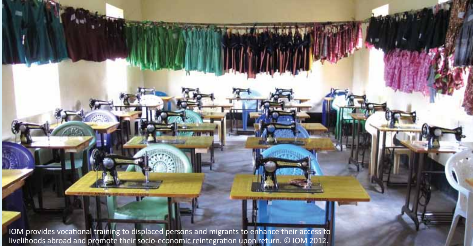
IOM provides vocational training to displaced persons and migrants to enhance their access to livelihoods abroad and promote their socio-economic reintegration upon return.

The events of 2011 exposed not only the energy and will for political change within the region, but also the engagement of the Arab expatriate community in the social and political affairs of their home countries. Governments and their expatriate communities have begun to move from a position of mutual suspicion under previous regimes to a position of mutual cooperation within an inclusive political process. IOM's extensive work over the past few years in the field of