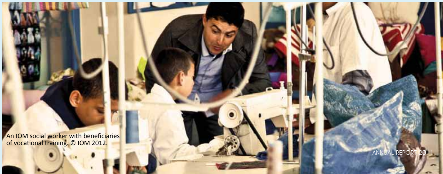
An IOM social worker with beneficiaries of vocational training.

Morocco is also a transit country for trafficked victims, with a significant number of victims originating from Nigeria. Recruiters use the lure of good jobs in Morocco or Europe, but many trafficked persons are exploited, after transiting through Morocco, through forced prostitution or forced labour in Spain and elsewhere in Europe. In 2011, IOM assisted 10 Nigerian victims to return home, where they were referred to reintegration programmes run in cooperation with the Nigerian National Agency for Prohibition of Trafficking in Persons and supported to set-up a business to help them reintegrate into society.