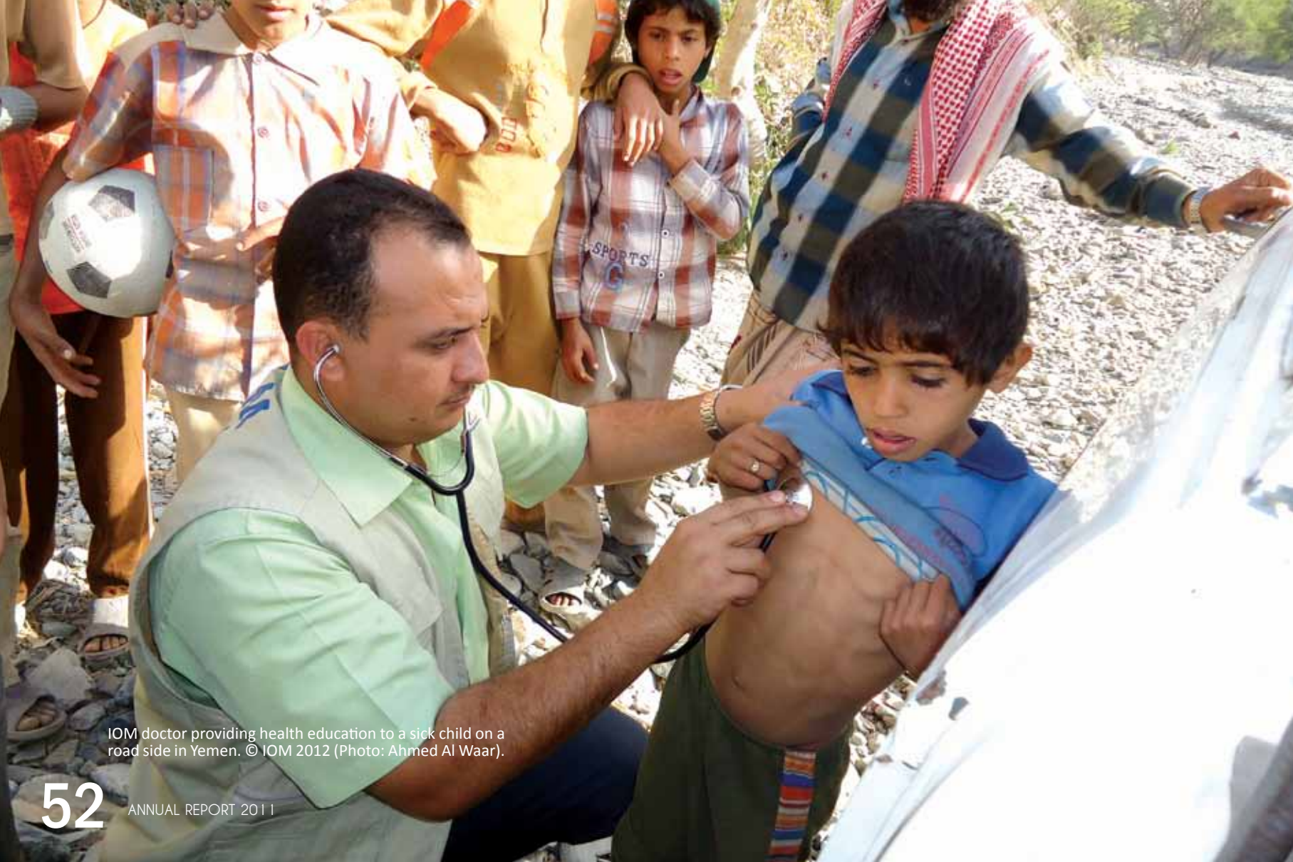
IOM doctor providing health education to a sick child on a road side in Yemen.