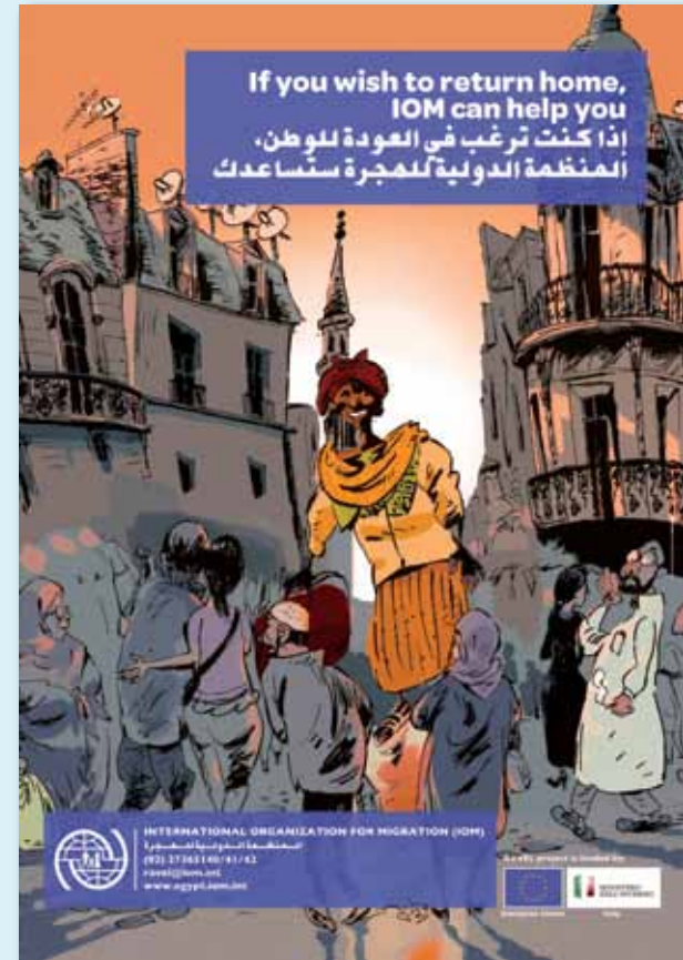
A poster to raise awareness on IOM's Regional Assisted Voluntary Return Program among stranded migrants in Egypt, designed through competition. © IOM 2012, Illustration: Shennawy.

IOM's AVRR beneficiaries include rejected asylum-seekers or those likely to face rejection of their claim, irregular migrants, stranded migrants, victims of trafficking and other vulnerable groups, including unaccompanied minors, elderly people or those with particular medical needs. In 2011, IOM provided AVRR assistance to migrants returning voluntarily to their countries of origin in the MENA region, largely from Europe. IOM also assisted sub-Saharan and other migrants who wished to return home after being stranded in the region.