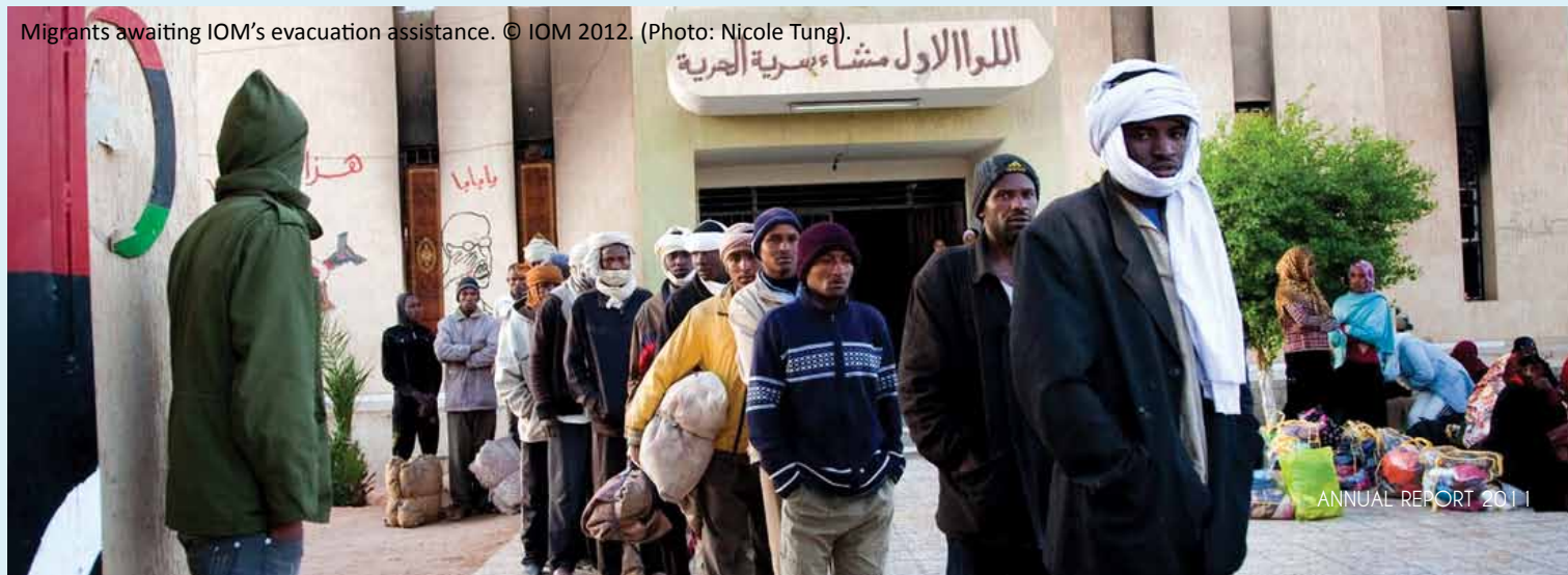
Migrants awaiting IOM's evacuation assistance.

In addition to providing shelter, IOM psychosocial workers provided psychosocial assistance for Libyan and migrant crisis-affected youth and their families, and established three recreational and counselling centres where youth participate in educational, social and/or therapeutic activities. The centres