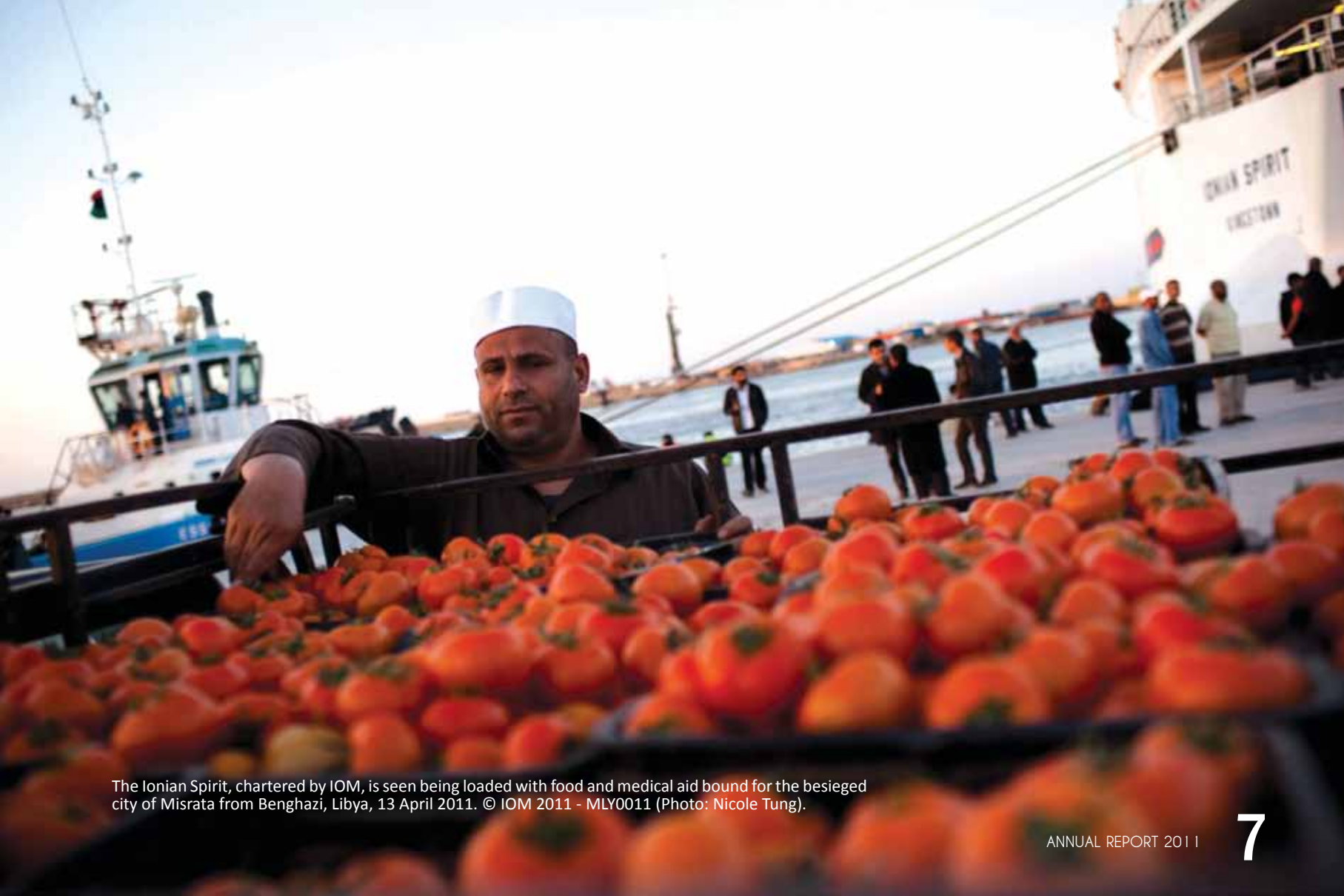
The Ionian Spirit, chartered by IOM, is seen being loaded with food and medical aid bound for the besieged city of Misrata from Benghazi, Libya, 13 April 2011. © IOM 2011 - MLY0011 (Photo: Nicole Tung).