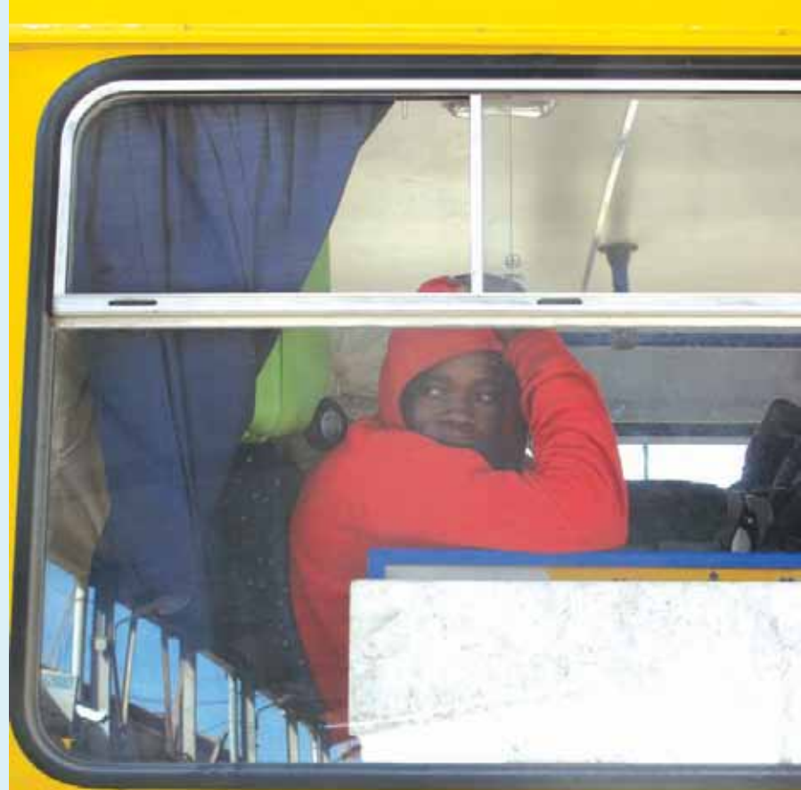
IOM evacuating migrants from Libya via Tunisia.

As a result of the 2011 crisis in Libya, nearly 350,000 migrant workers, almost a third of them returning Tunisians, fled across the Libya–Tunisia border. Within days of the conflict's onset, IOM had deployed teams to the border area and was working in partnership with government authorities, the Tunisian Red